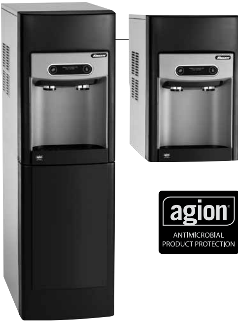
Shown with optional base stand

NOTE: For use in applications with greater than 5 mg/l but less than 400 mg/l total dissolved solids in water and less than 200 mg/l hardness (either naturally occurring or treated with reverse osmosis or other TDS reducing technology). Not recommended for use with softened water.